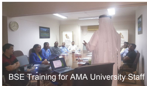
BSE Training for AMA University Staff