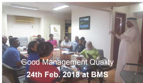
Good Management Quality 24th Feb. 2018 at BMS