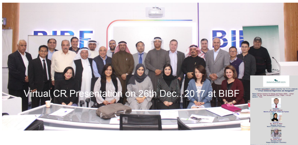
Virtual CR Presentation on 26th Dec. 2017 at BIBF